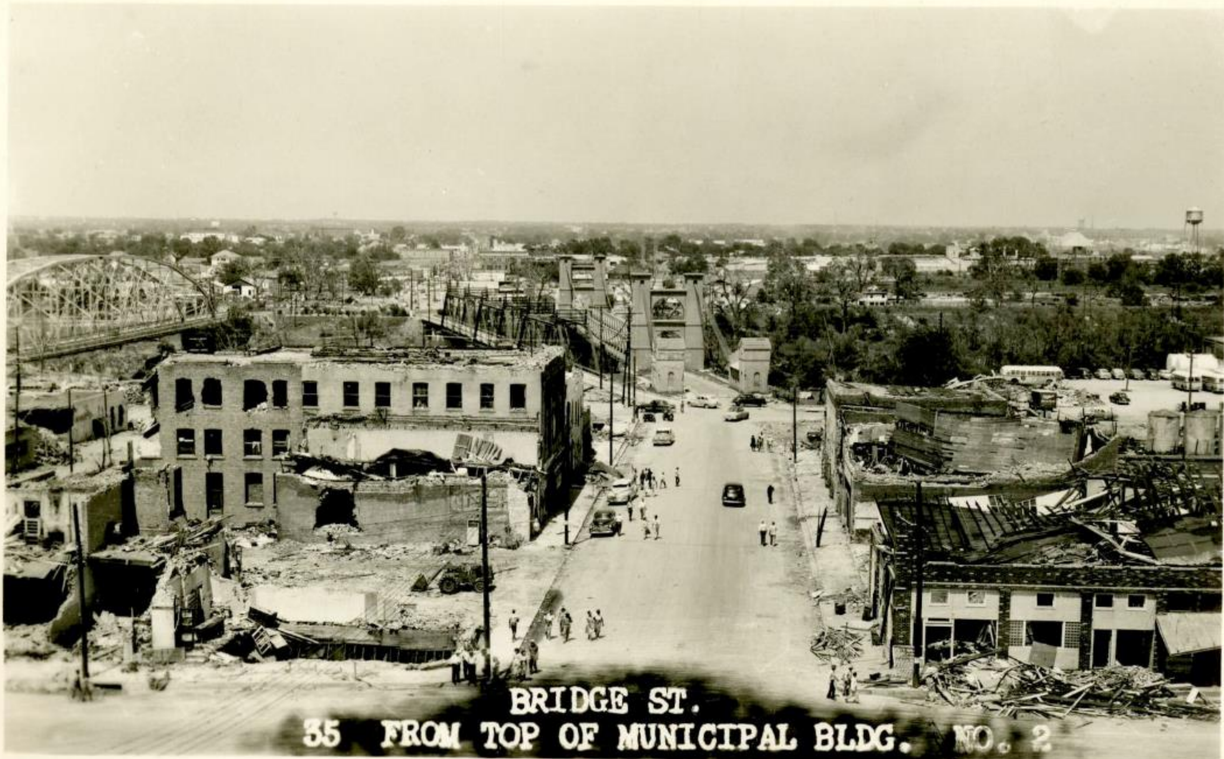
BRIDGE ST. 35 FROM TOP OF MUNICIPAL BLDG. NO. 2