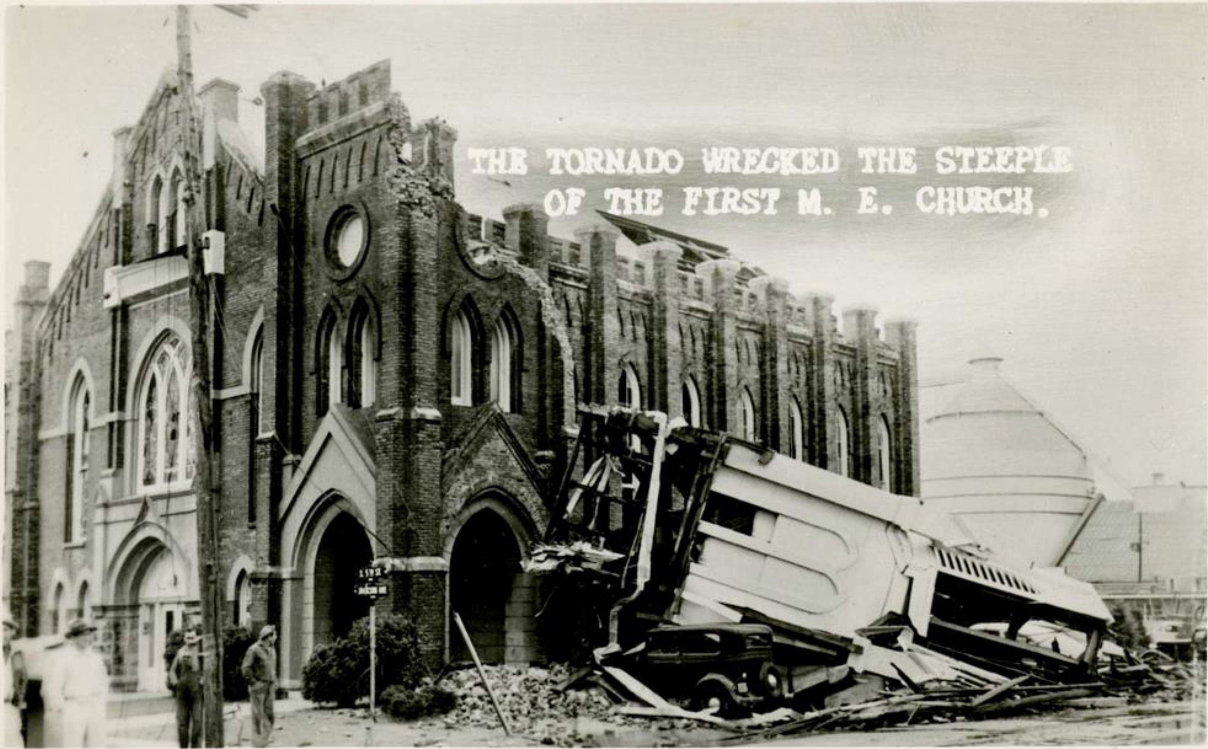
THE TORNADO WRECKED THE STEEPLE OF THE FIRST M. E. CHURCH.