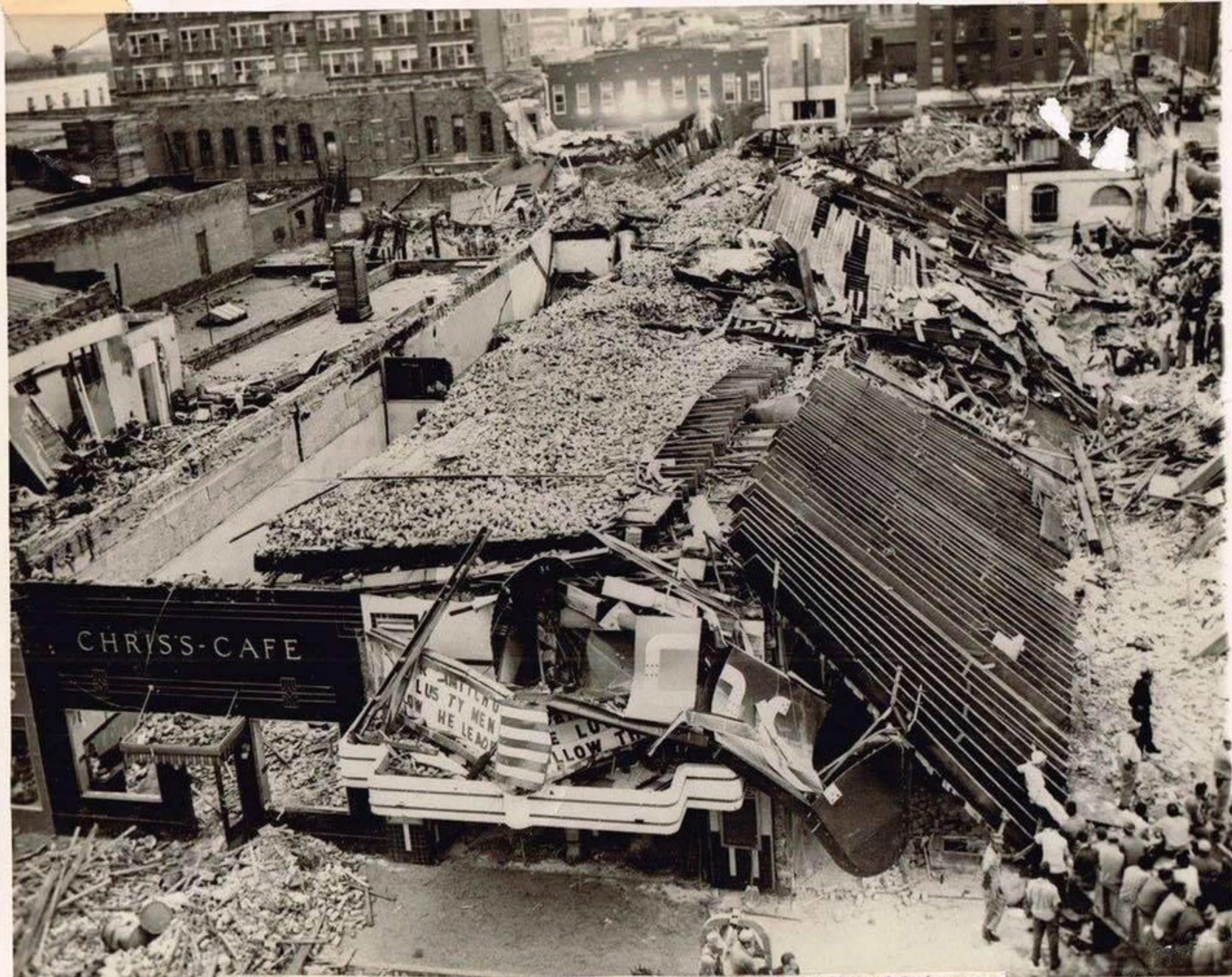
WACO, Texas, May 11, 1953--Bricks, beams and other debris